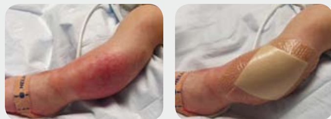
Mepilex ® Border Lite dressing offers flexibility and mobility while allowing protection of fragile tissue