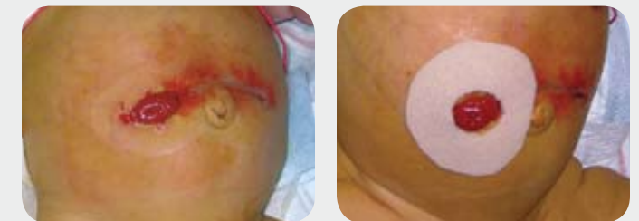
Mepilex ® Lite may be used to protect fragile peristomal tissue from traditional adhesives found in pouching products.