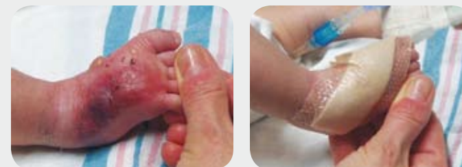
Mepilex ® Border Lite dressing is an all-in-one dressing for low exuding wounds. Flexible and conformable.