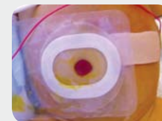
Pouch may be applied over Mepilex ® Lite. Exposed edges may need to be secured with Mepitac ® tape